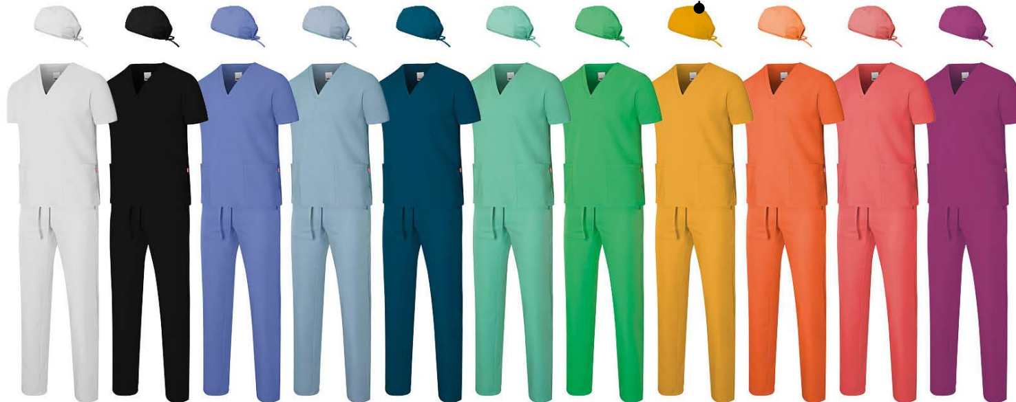
Microfiber scrub cap (Ref.:534007)