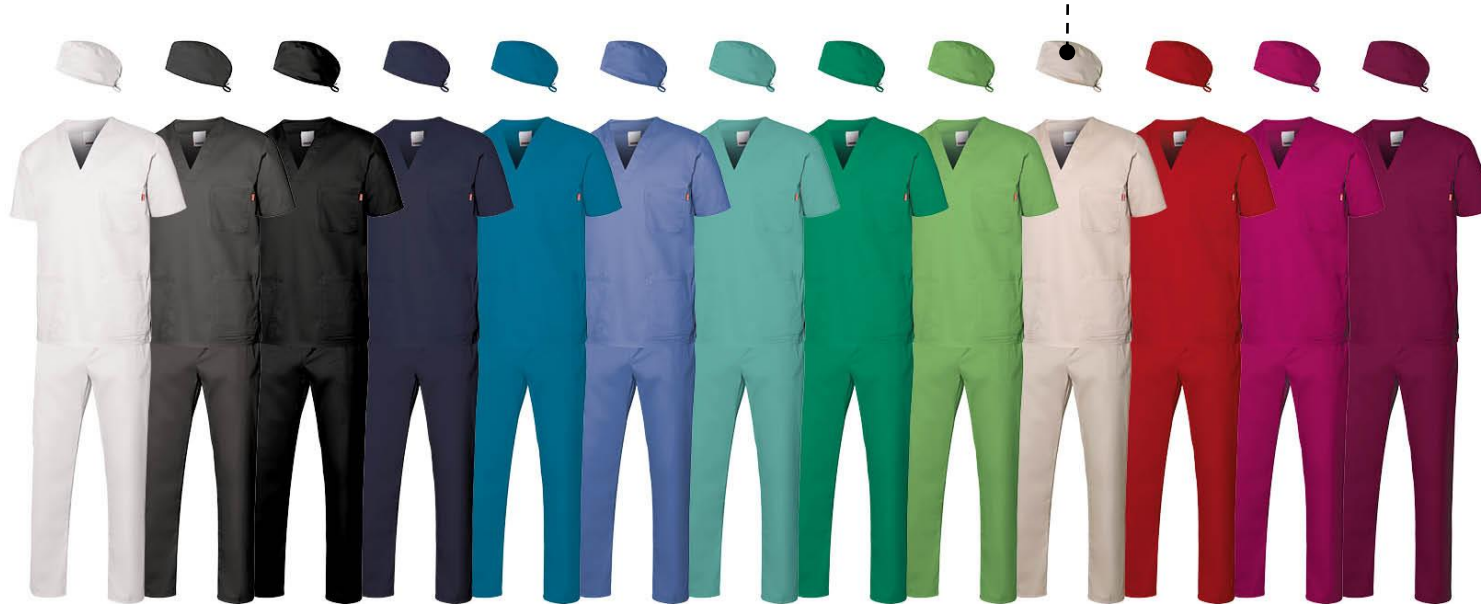
Stretch scrub cap (Ref.:534006S)